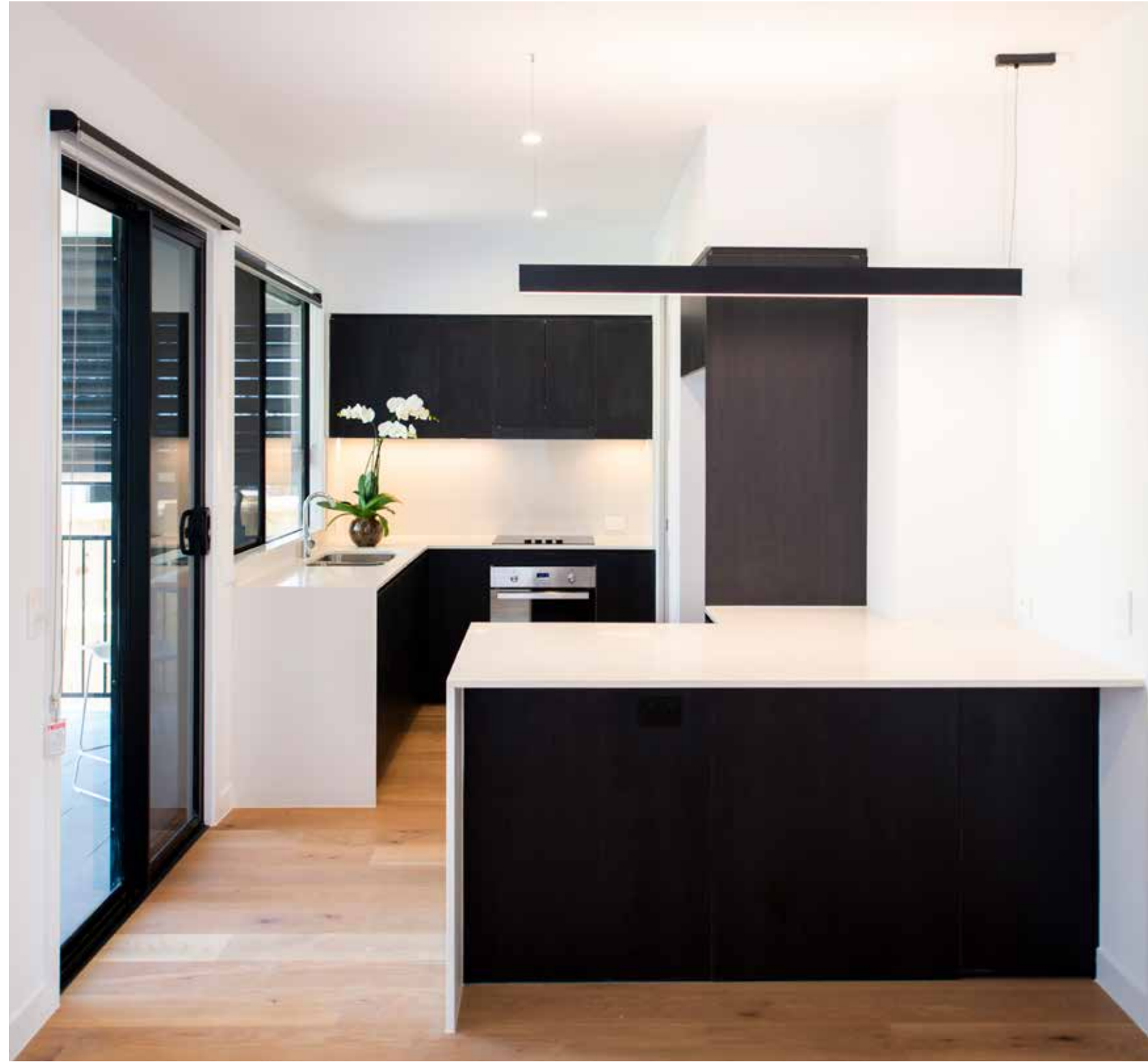
Stylish and functional