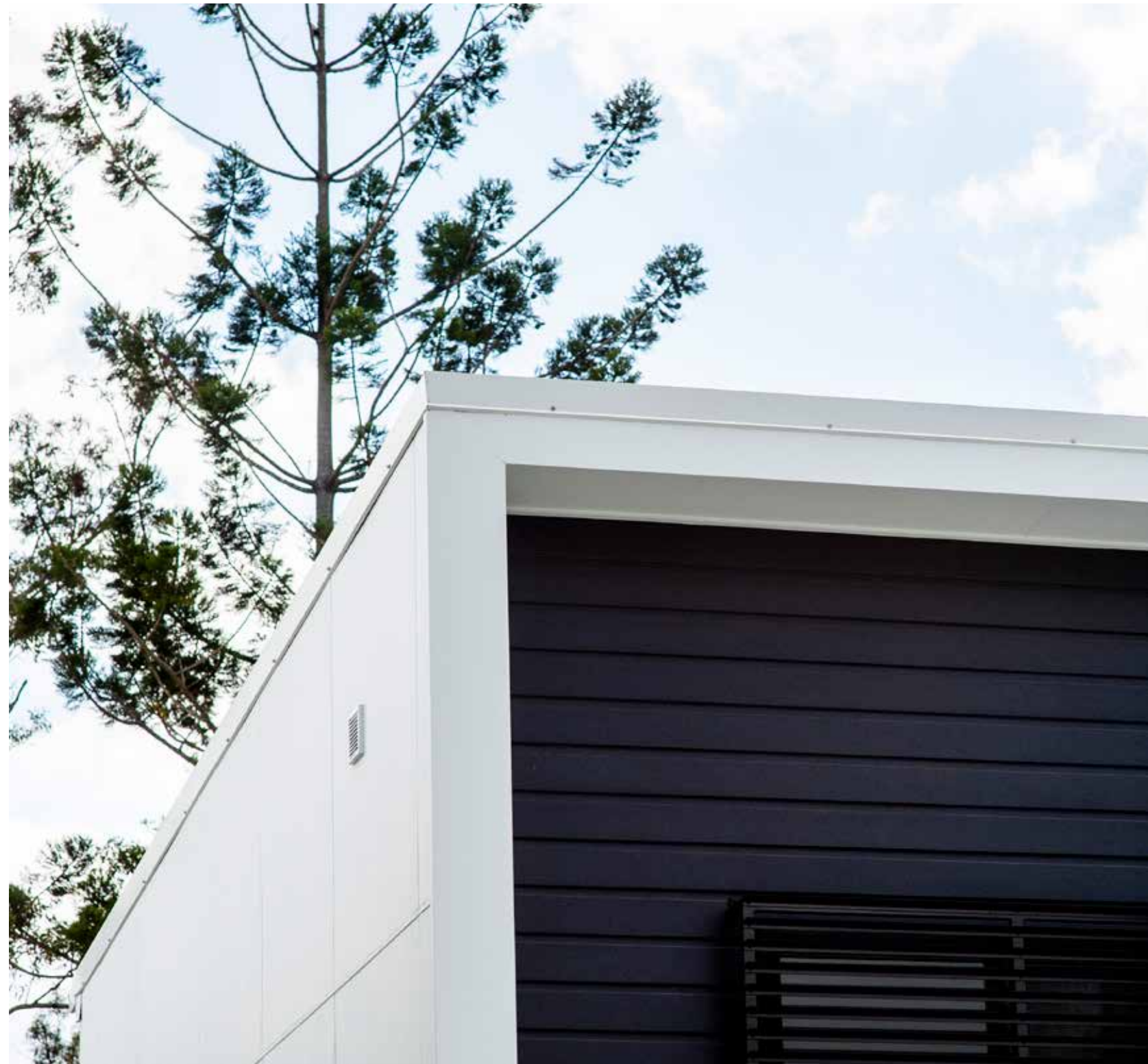
Proud to call home