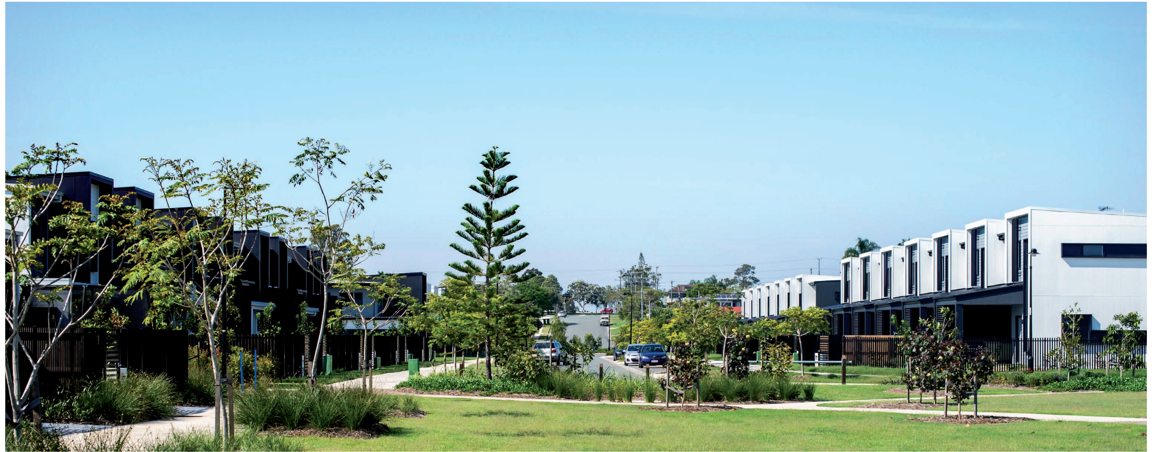
Blending into a green community