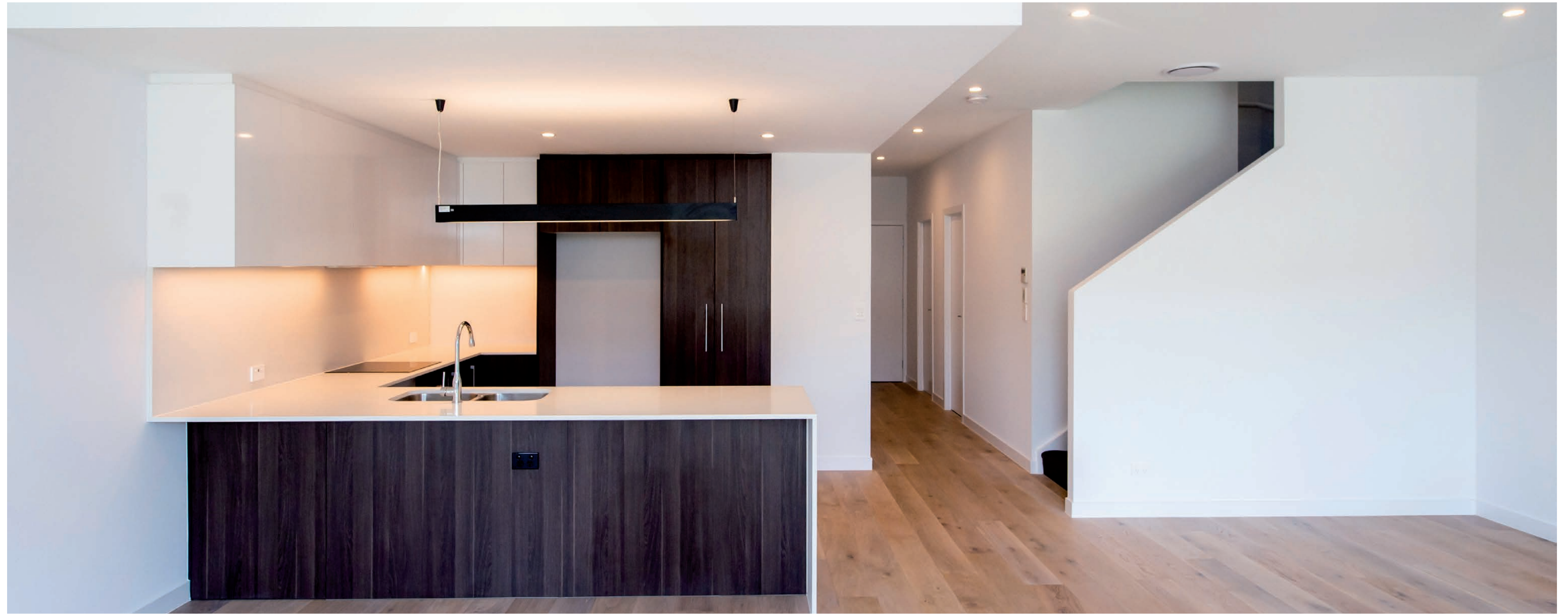
Modern and contemporary design